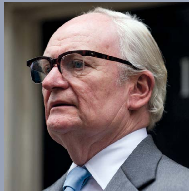
Jim Broadbent as Denis Thatcher