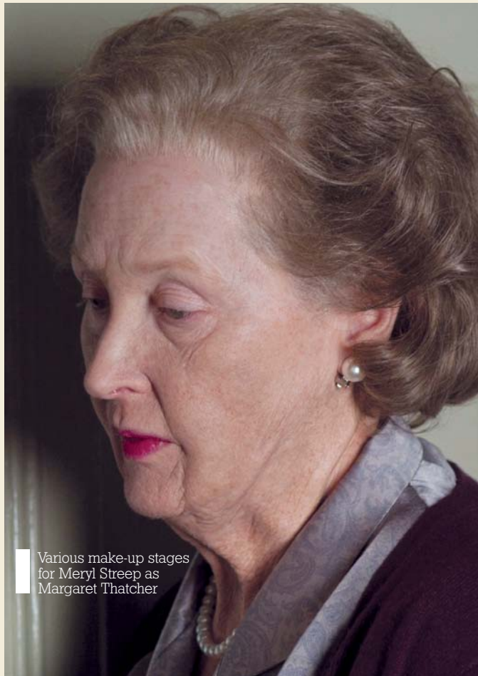
Various make-up stages for Meryl Streep as Margaret Thatcher