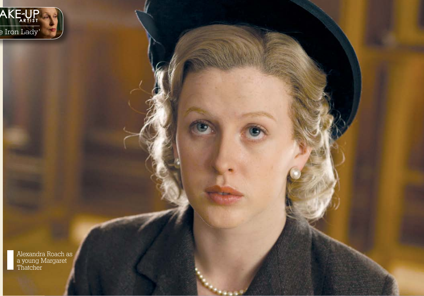
Alexandra Roach as a young Margaret Thatcher